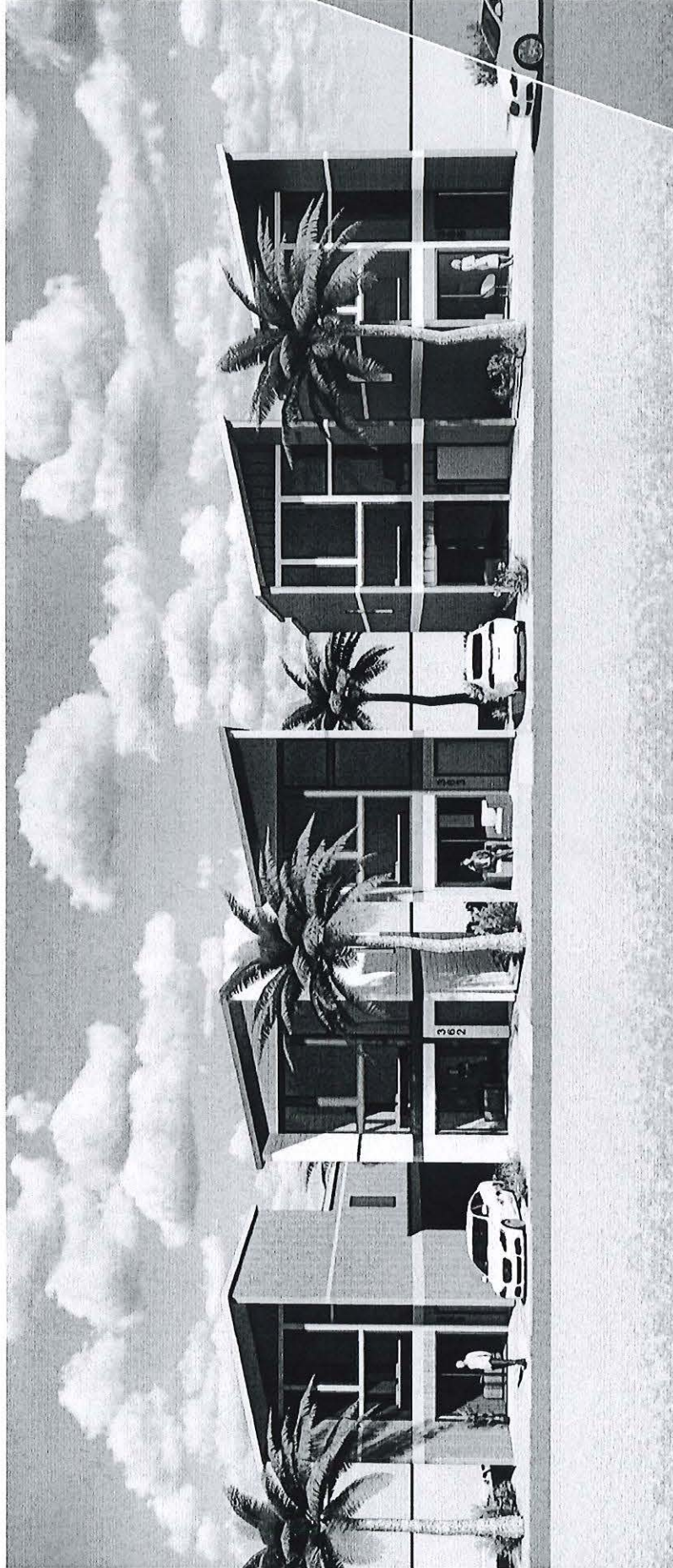
ARTISTRY AT PARK STATION | FRONT SITE PERSPECTIVE