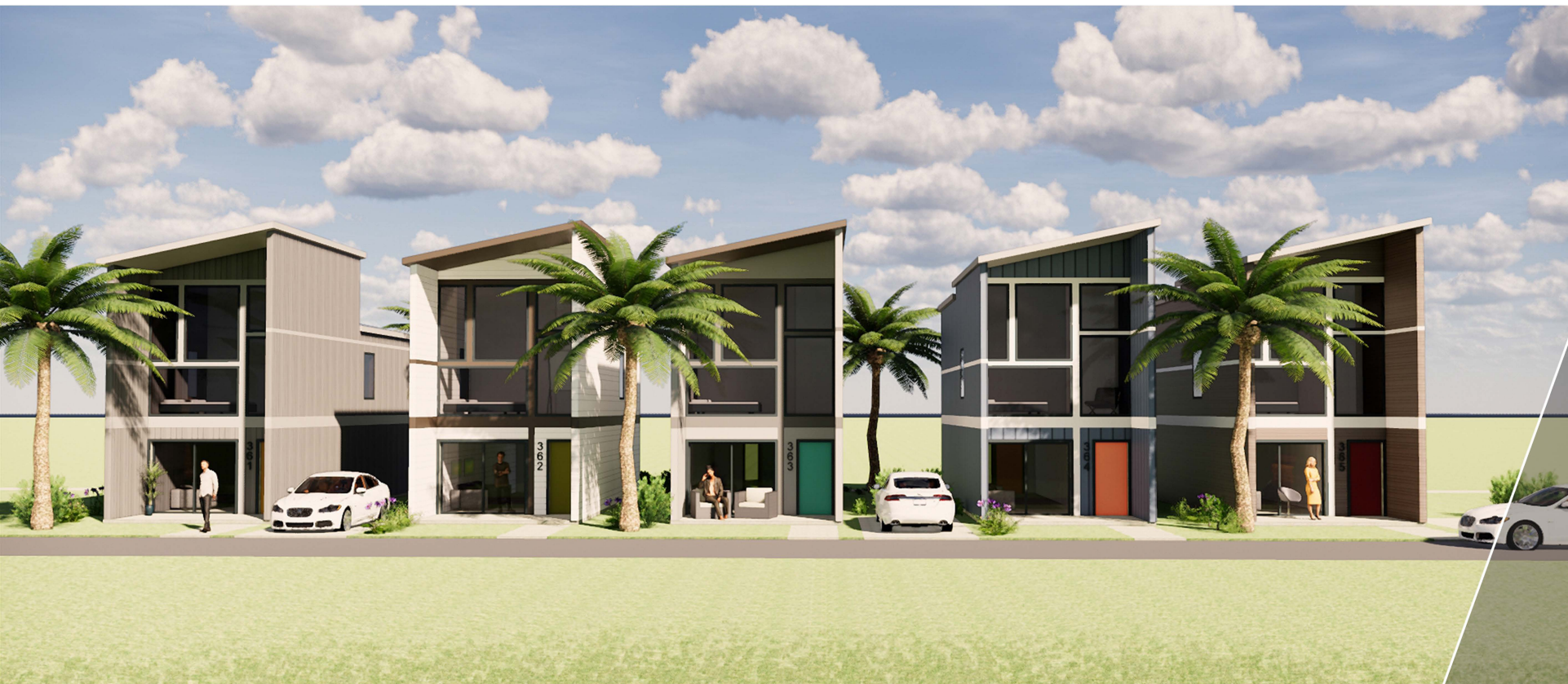
ARTISTRY AT PARK STATION | FRONT SITE PERSPECTIVE