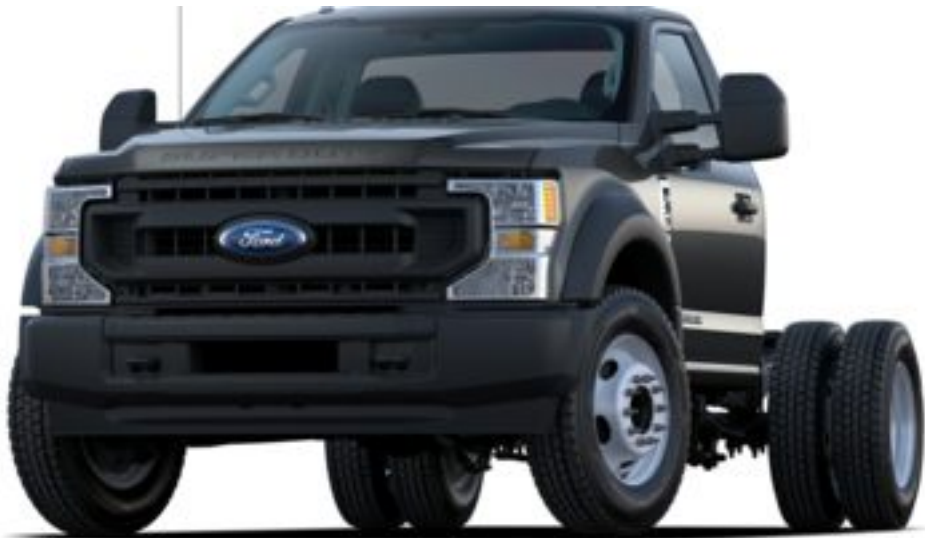
Note: Photo may not represent exact vehicle or selected equipment.

Vehicle: [Fleet] 2022 Ford Super Duty F-350 DRW (F3G) XL 2WD Reg Cab 145" WB 60" CA ( Complete )